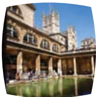
Roman Baths www.visitbath.co.uk

Trains: Hourly to Bristol Temple Meads and change for a frequent service to Bath Spa (though there are some through trains)