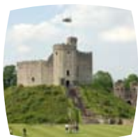
Cardiff Castle in the summertime

Journey Time: Cardiff – 25 minutes / Barry – 1 hour