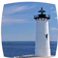
Fort Constitution Lighthouse