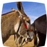
Donkeys walking on Weston-super-Mare beach