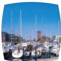
Swansea Marina – one of the few Blue Flag Marinas in Wales*

*© Produced by permission of the City and County of Swansea. www.visitswanseabay.com