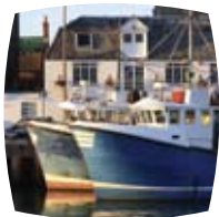
Fishing boats in Weymouth Harbor

Trains: For a good day out from Severn Tunnel Junction, you need to get the 0825 service to Bristol Temple Meads and change