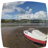
Holiday resort town Teignmouth, Devon